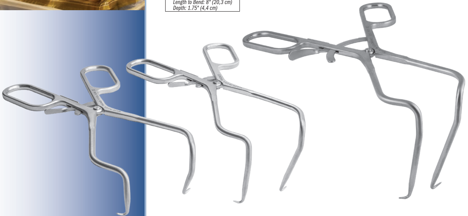
Typical position of most retractor handles