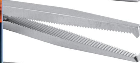
Tapered Narrow Jaw