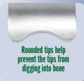
Rounded Tips #3415-02

Rounded tips help prevent the tips from digging into bone