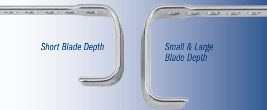
Short Blade Depth