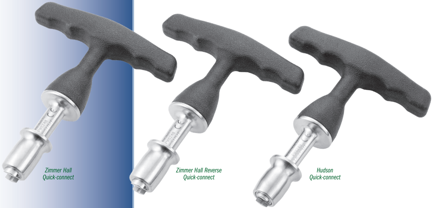
Zimmer Hall Quick-connect

Large easy grip soft silicone handled drivers help provide a sturdy non-slip grip