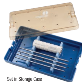
Set in Storage Case