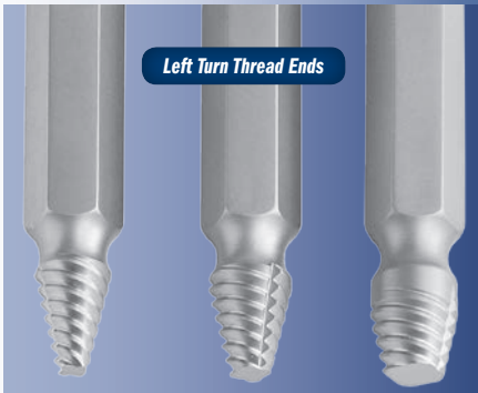
Left Turn Thread Ends