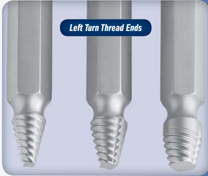
Left Turn Thread Ends