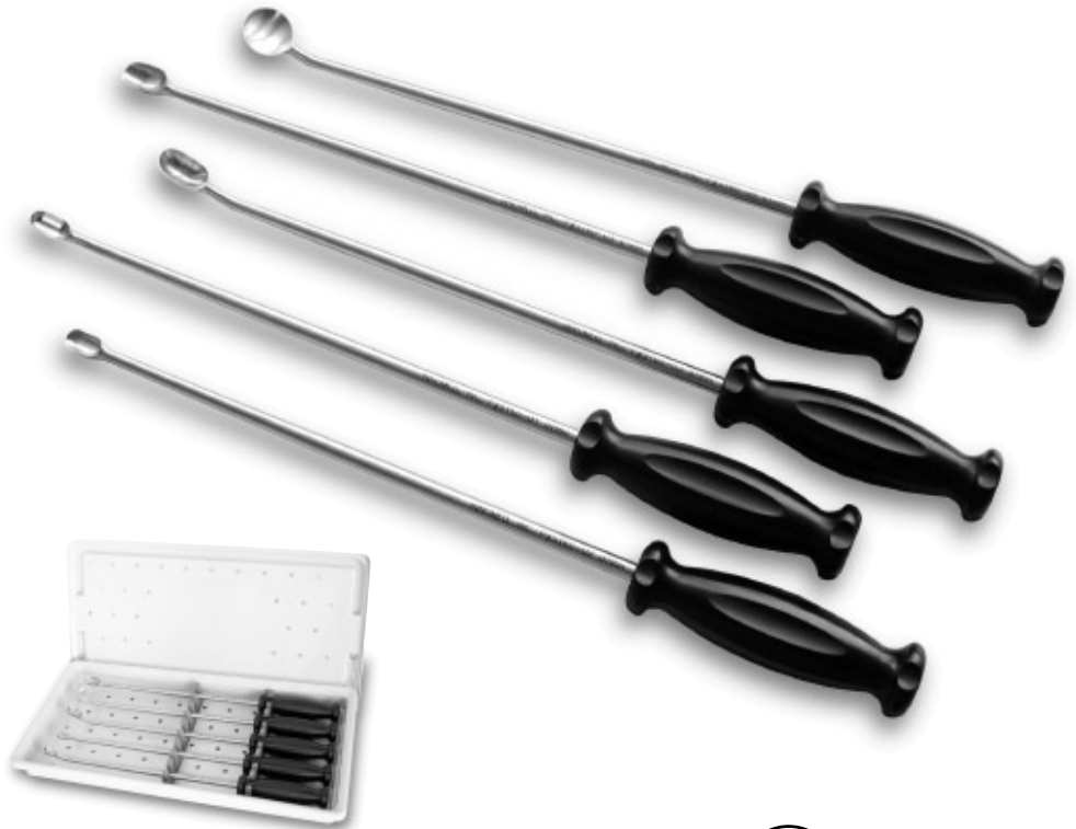
Storage Case Available

Allow better visualization into the medullary canal