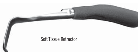
Soft Tissue Retractor