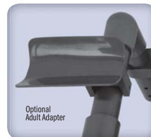
Optional Adult Adapter