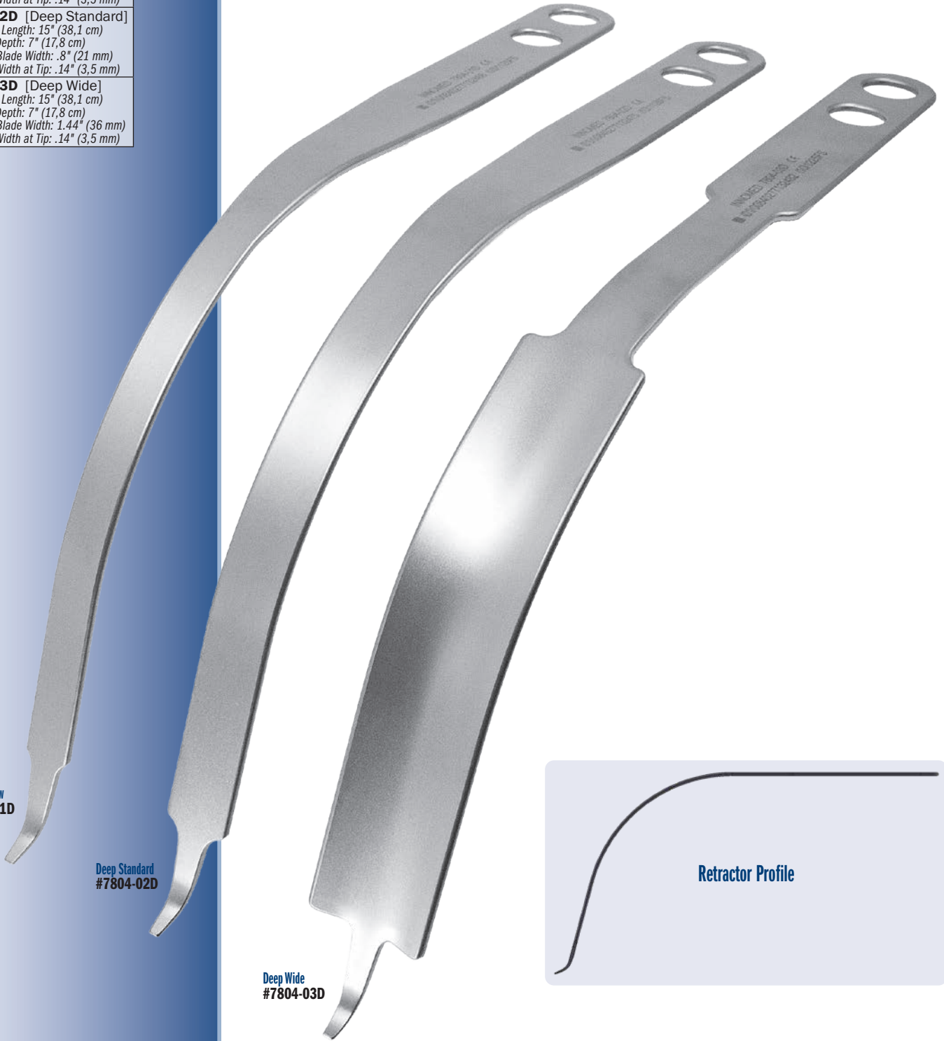
Deep Narrow #7804-01D