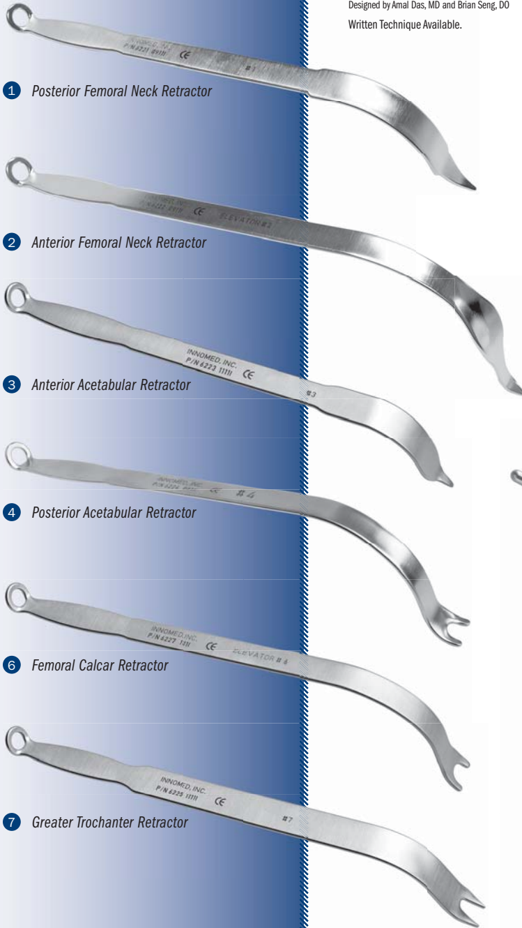
1 Posterior Femoral Neck Retractor