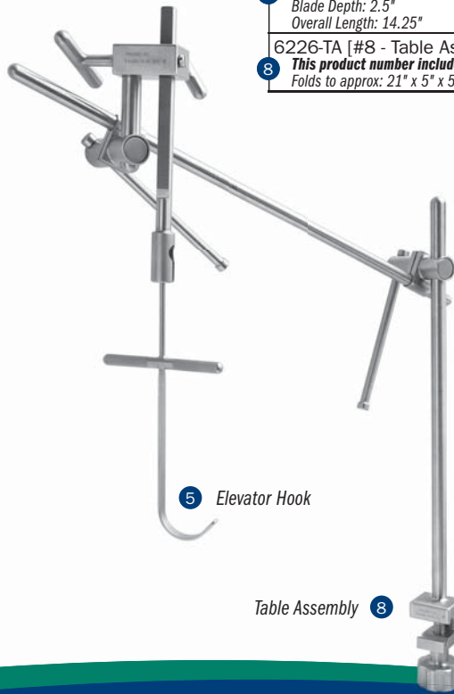
5 Elevator Hook

8 This product number includes one 6226-EH Elevator Hook Folds to approx: 21" x 5" x 5"