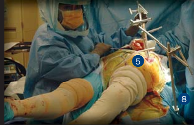
Table Assembly/Elevator Hook for femoral access