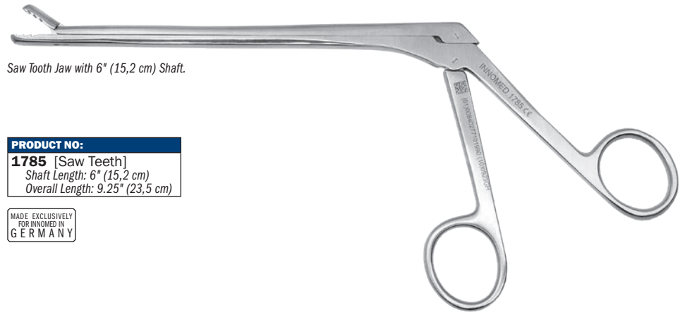
Saw Tooth Jaw with 6" (15,2 cm) Shaft.

PRODUCT NO: 1785 [Saw Teeth] Shaft Length: 6" (15,2 cm) Overall Length: 9.25" (23,5 cm)