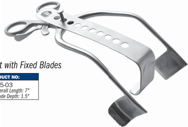
Bent with Fixed Blades

Used for soft tissue retraction during hip & shoulder surgery